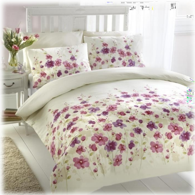
Floral printed duvet cover