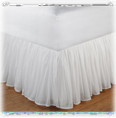
Frilled bed skirts