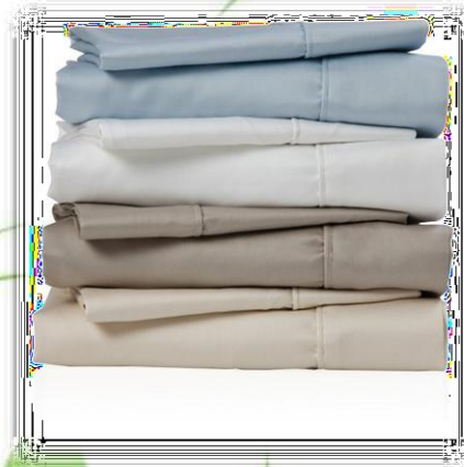
Z hem on Flat & Pillow cases