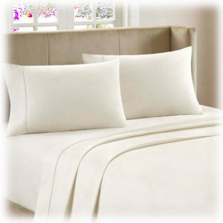
Flat sheet & pillow cases