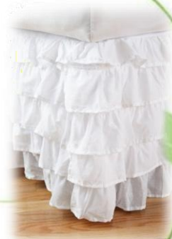
Ruffled bed skirts