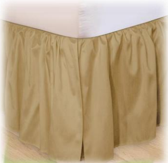
Regular bed skirts