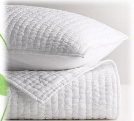
Mini grid quilt