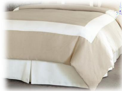
Double colour duvet cover