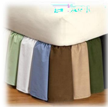
Panel bed skirts