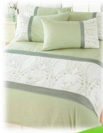
Embroidered border duvet cover